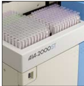
200 Sample Loader