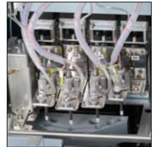
4 Wash Probes