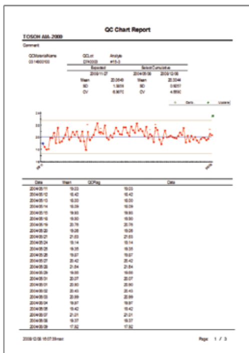
QC Result Print-out