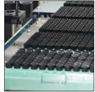
576 Pipette Tips