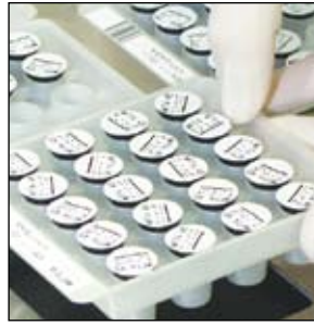
960 Test Cups