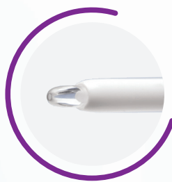
Smooth tip transition with outer sheath