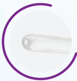
Hand crafted soft inner catheter