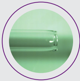
With fire polish