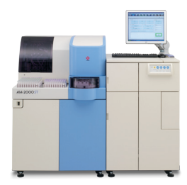
AIA-2000 200 Tests Per Hour