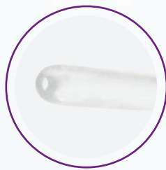
Hand crafted soft inner catheter