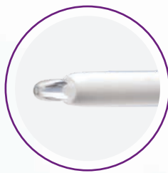
Smooth tip transition with outer sheath